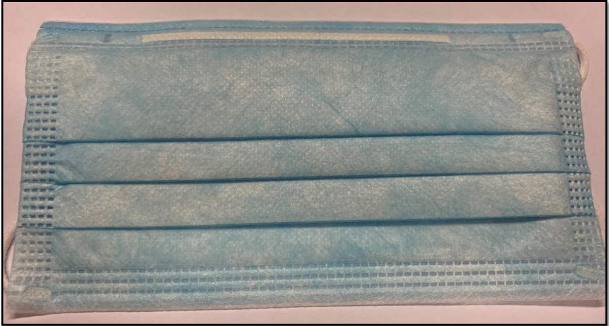
Figure 1. "Community Face Mask" sample as received